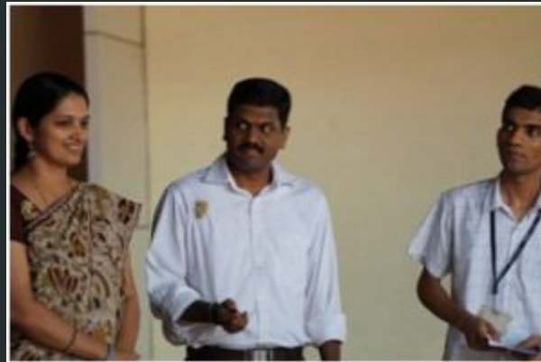
Release of abhuday Patrika